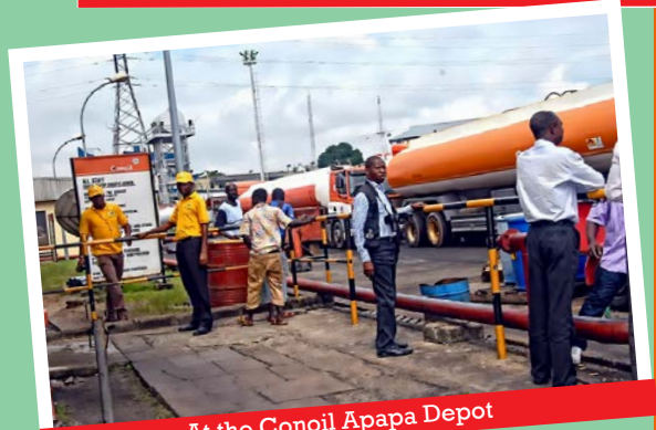
At the Conoil Apapa Depot